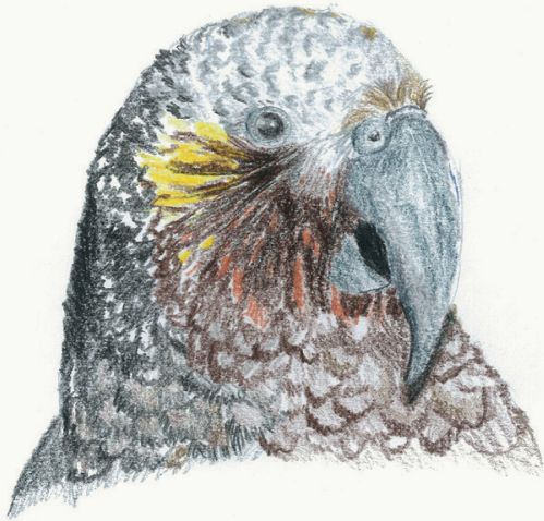
Jasper Fischer 2019 – 2nd place – 13yrs

For students from the Eastern Suburbs of Wellington with a passion for the arts. Visual, music, performing arts – wherever your talent lies a FAB Arts Bursary can help support it.