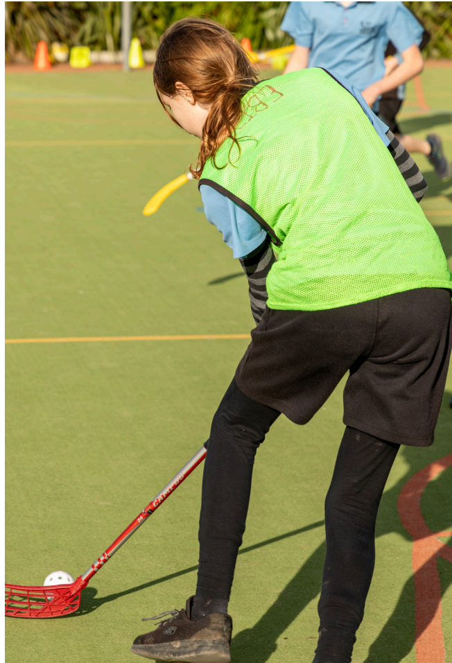
P.E. - Fundamental skill development