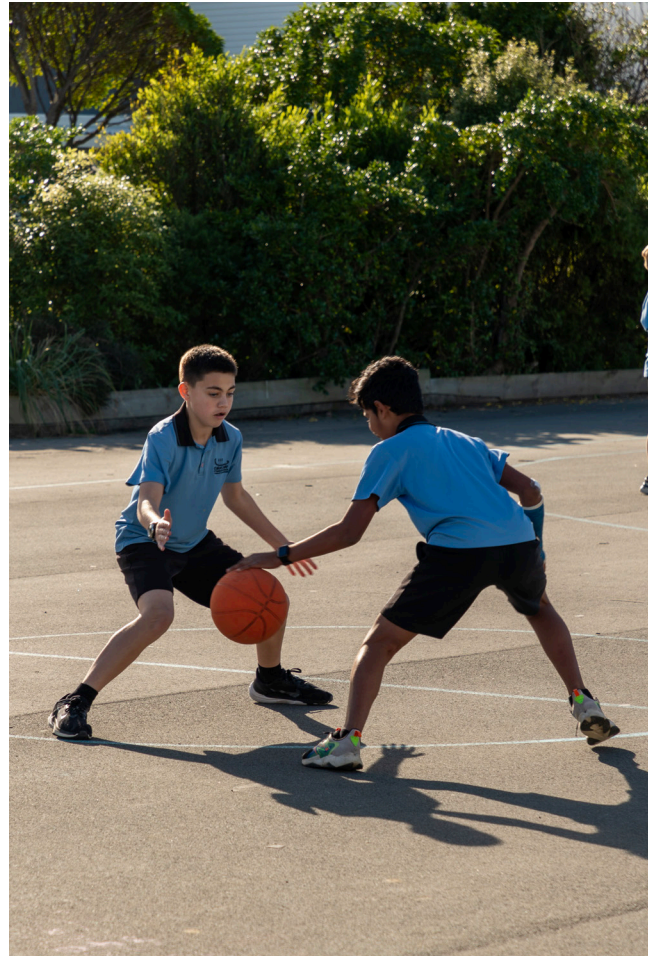
Team Games - Social Development