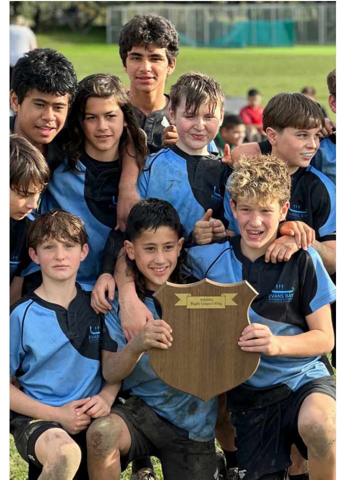
Inter-School competition - Competitive Development