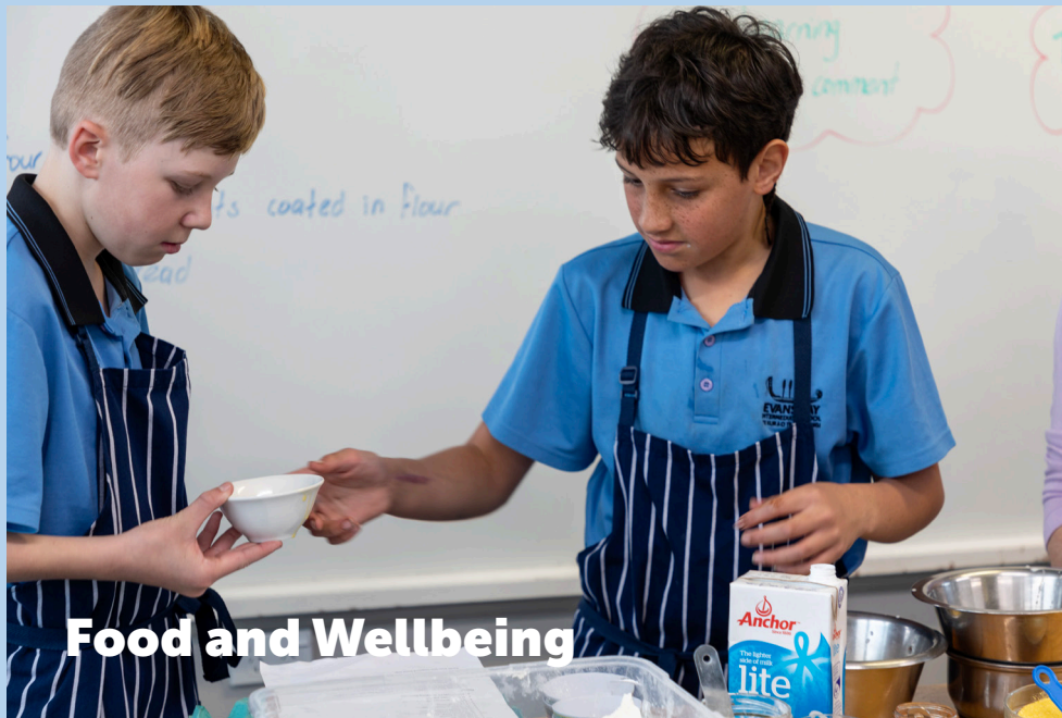
Food and Wellbeing